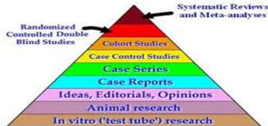
The Five steps to practicing evidence – based orthodontics

The hierarchy of evidence provides a universally accepted framework for ranking the best available evidence on the basis of study design. they are listed here in ascending order of merit (1-6) .